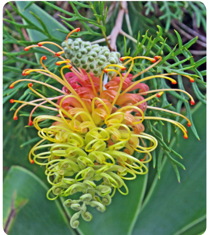
Grevillea 'Peaches and Cream' respond and benefit from regular pruning