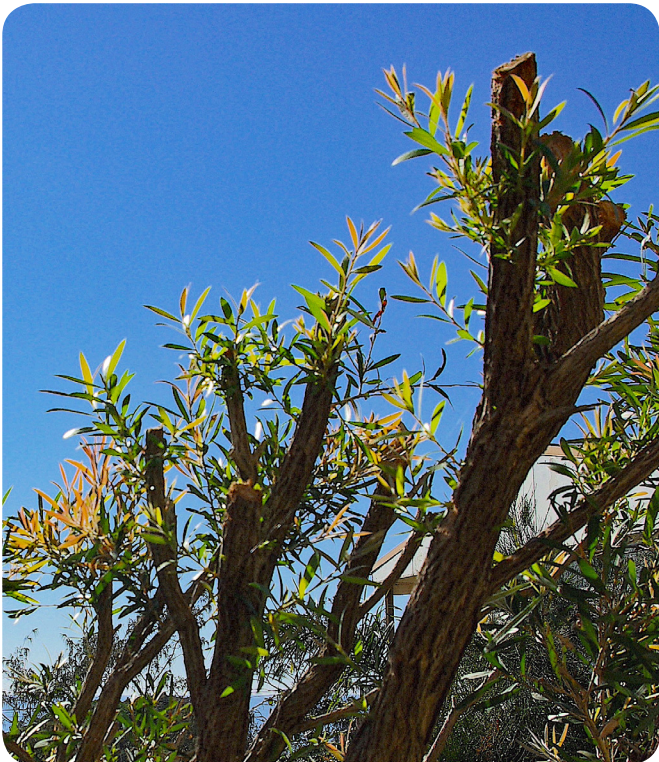
Callistemon resprouting after very hard pruning

The benefits of judicious and responsible pruning can be exciting and wonderfully rewarding. Come along to the meeting loaded with questions and even your experiences which can be shared with the group.