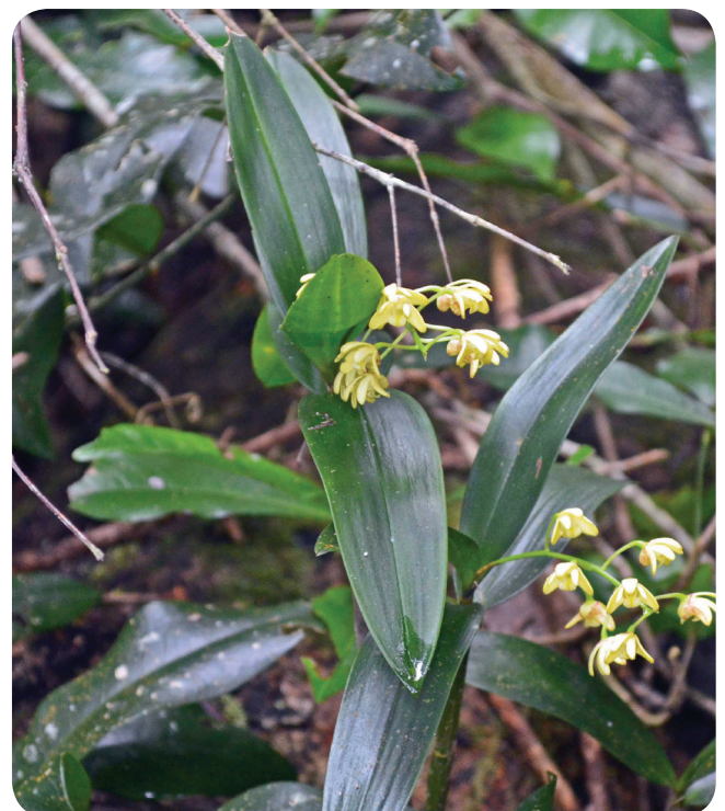
The only orchids we found battling for space on a tree trunk