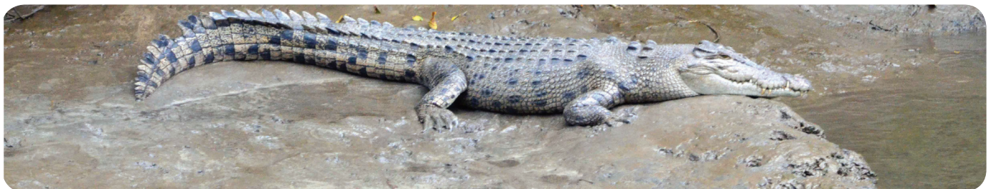
A Saltwater Crocodile were warming themselves on mudbanks

THANK YOU TO FACEY'S WHOLESALE NURSERY FOR THEIR DONATION OF PLANTS FOR OUR RAFFLE EACH MONTH