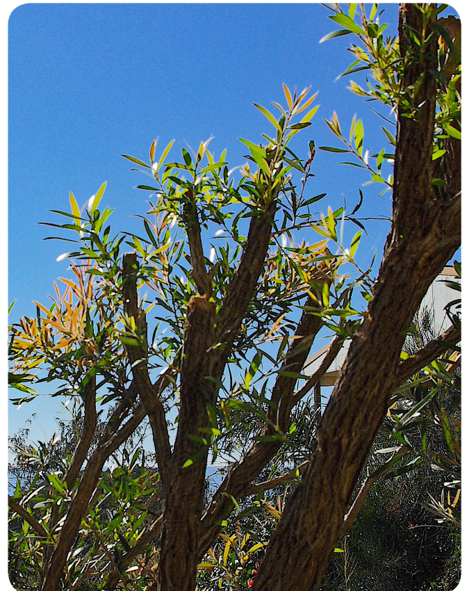
This Callistemon is reshooting after very hard pruning