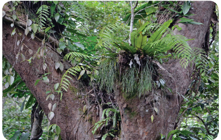
Tassel fern hanging below the Birds Nest fern.