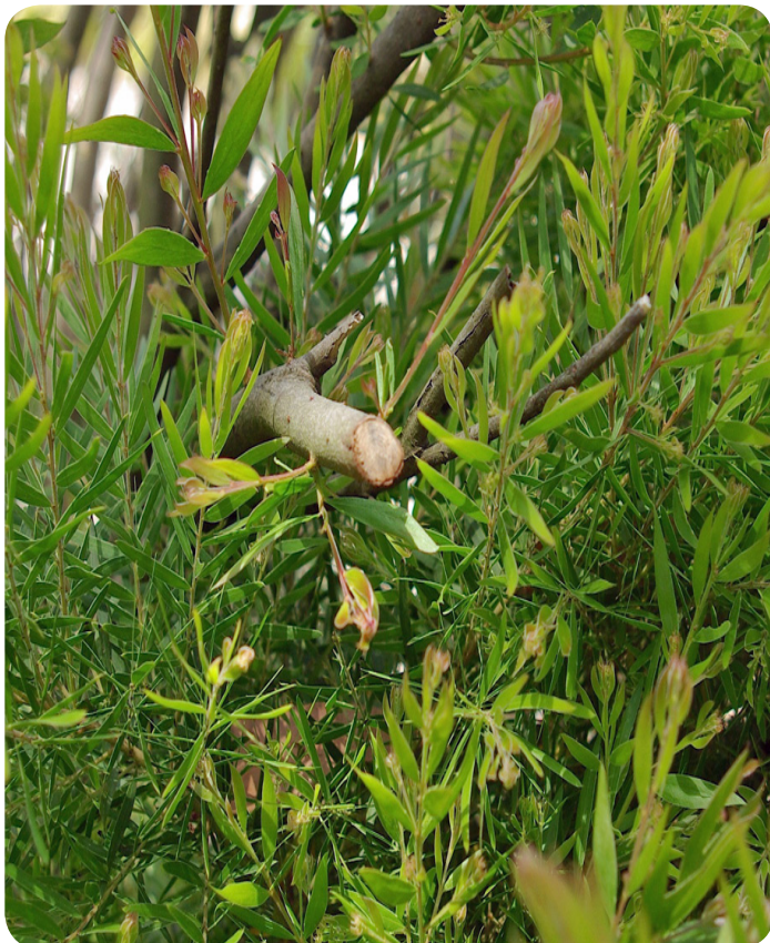
Acacia fimbriata Dwarf