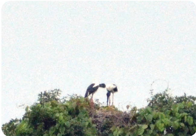
Jabirus building a Nest